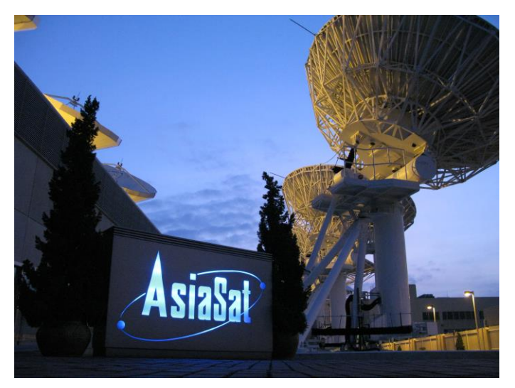
AsiaSat's state-of-the-art earth station in Hong Kong.

Since 1990, AsiaSat has been at the forefront of Asian satellite television. Today, AsiaSat operates Asia's most popular TV distribution platforms for South Asian, East Asian, European, Middle Eastern and international programming. Over 450 television and radio channels are delivered by